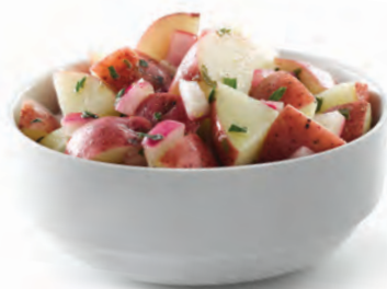
HOT TARRAGON POTATO SALAD (GLUTEN FREE)* Made with MINOR'S Natural Gluten Free Chicken Base.