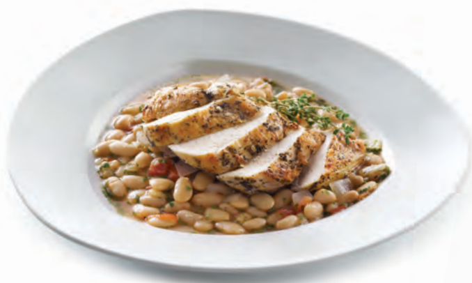
HERBED CHICKEN WITH WHITE BEAN RAGOUT (GLUTEN FREE)* Made with MINOR'S Natural Gluten Free Chicken Base.