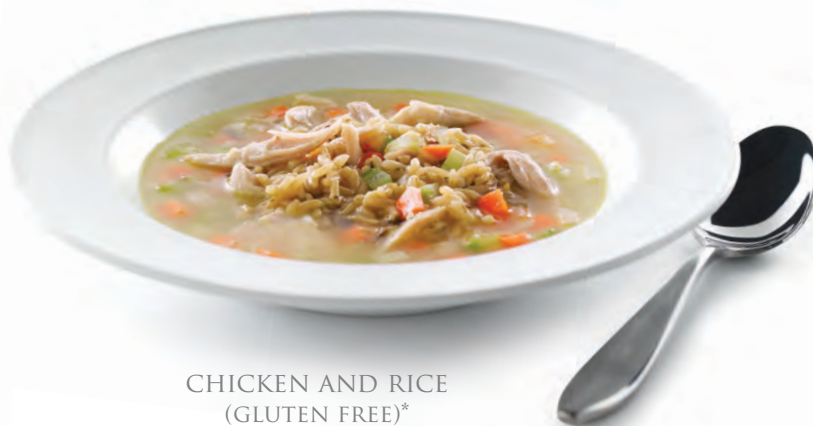
CHICKEN AND RICE (GLUTEN FREE)* Made with MINOR'S Natural Gluten Free Chicken Base.