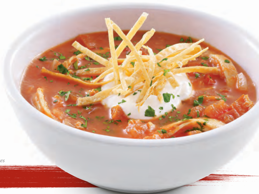
TRADITIONAL CHICKEN TORTILLA SOUP (GLUTEN FREE)* Made with MINOR'S Natural Gluten Free Chicken Base.

*When using Gluten Free ingredients, recipes and proper back of house procedures