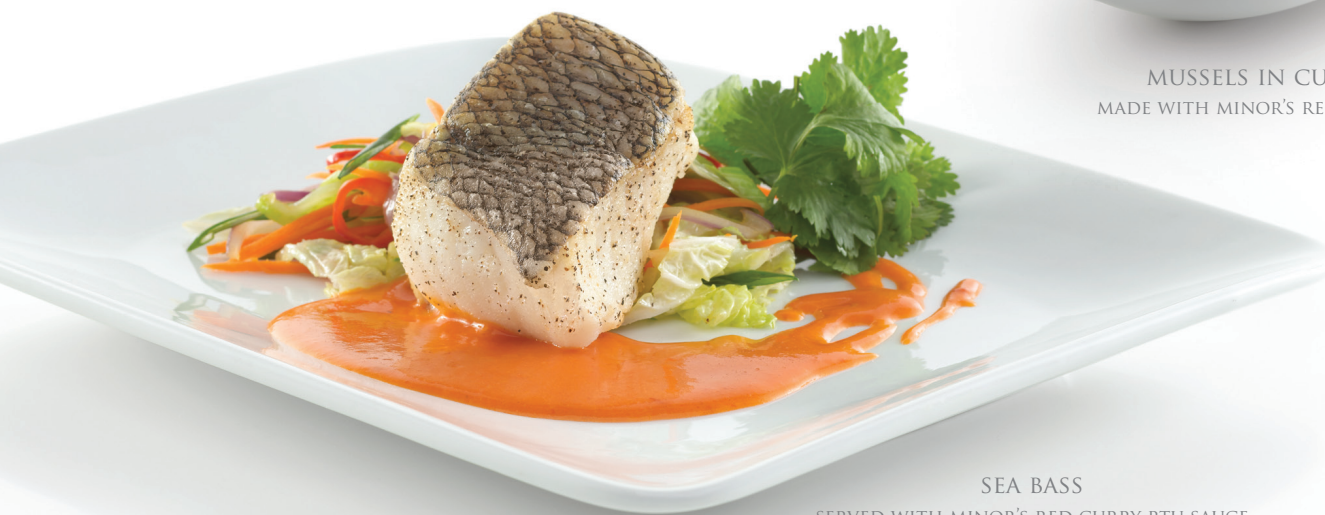
SEA BASS SERVED WITH MINOR'S RED CURRY RTU SAUCE