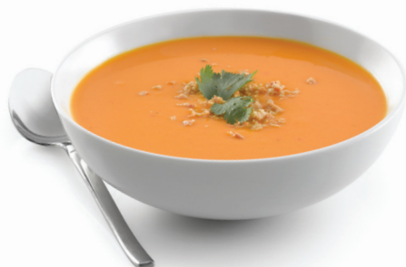
SWEET POTATO SOUP MADE WITH MINOR'S RED CURRY RTU SAUCE