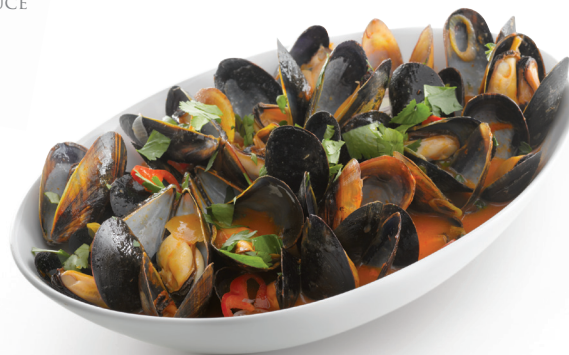
MUSSELS IN CURRY BROTH MADE WITH MINOR'S RED CURRY RTU SAUCE