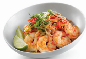
SHRIMP NOODLE BOWL MADE WITH MINOR'S RED CURRY RTU SAUCE