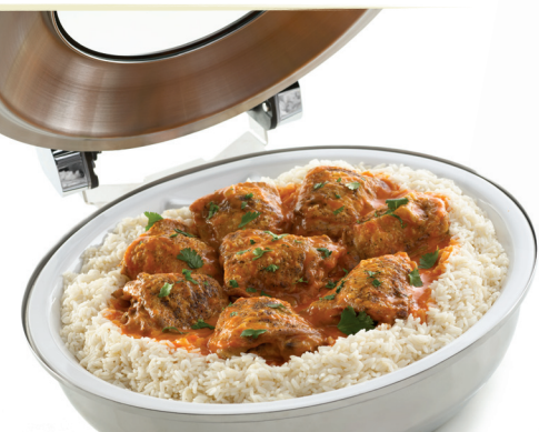
CHICKEN THIGHS MADE WITH MINOR'S RED CURRY RTU SAUCE